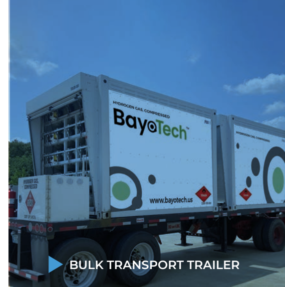
BULK TRANSPORT TRAILER