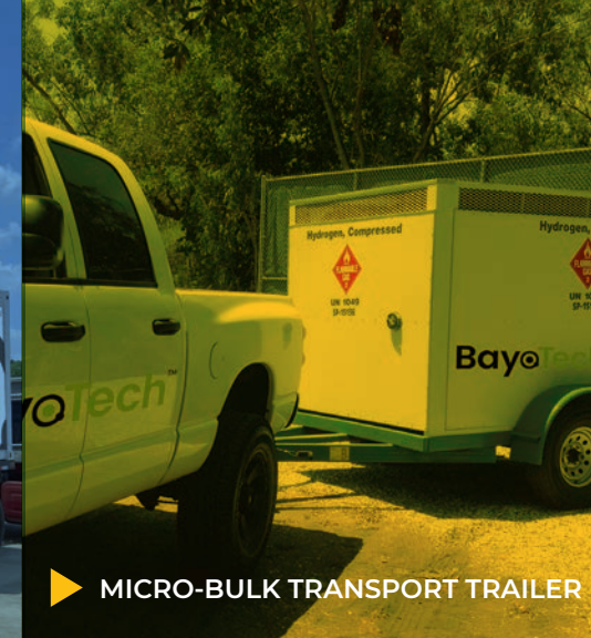
MICRO-BULK TRANSPORT TRAILER