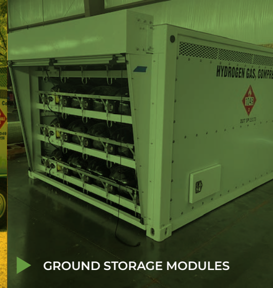
GROUND STORAGE MODULES